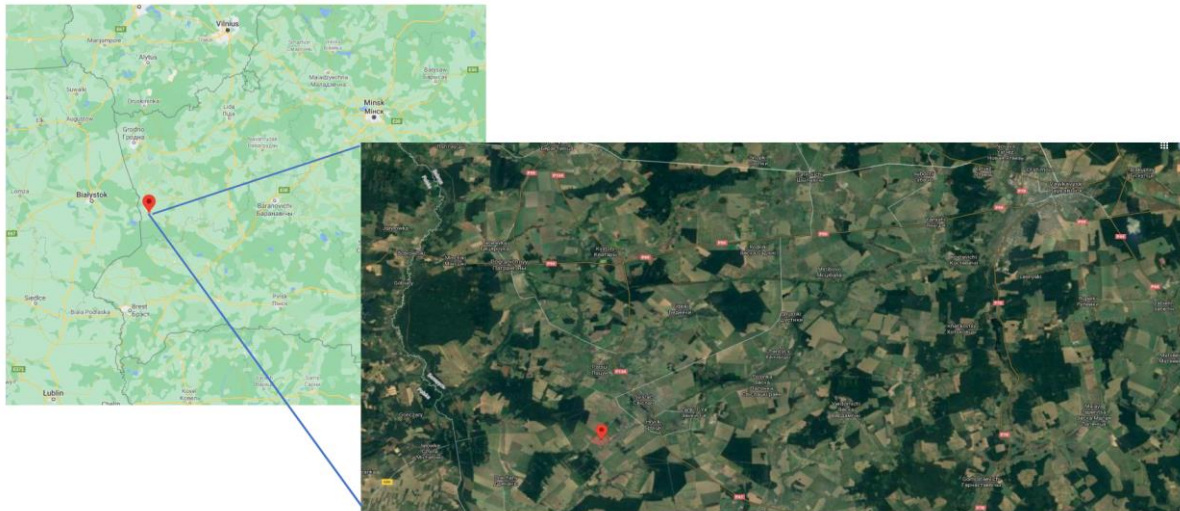
Figure 2-1 – HS Belacon sawmill location in Svisloch, Grodno Region, Belarus

The site is located in Precinct 12 of the "Grodnoinvest" Free Economic Zone in a designated industrial area. The location is presented in Figures 2-1 to 2-3 below. The site is currently greenfield, with no known prior use, other than for agriculture.