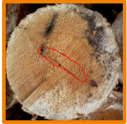
Superficial frontal core crack