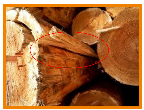
Crack on the lateral surface

Relevant are frontal and core cracks and also cracks on the lateral surface. Logs with just superficial frontal and core cracks are not downgraded, whereas logs with deep frontal and core cracks and also cracks on the lateral surface are downgraded.