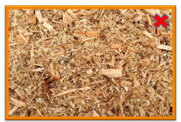
Unsuitable Chips – Fine Fraction