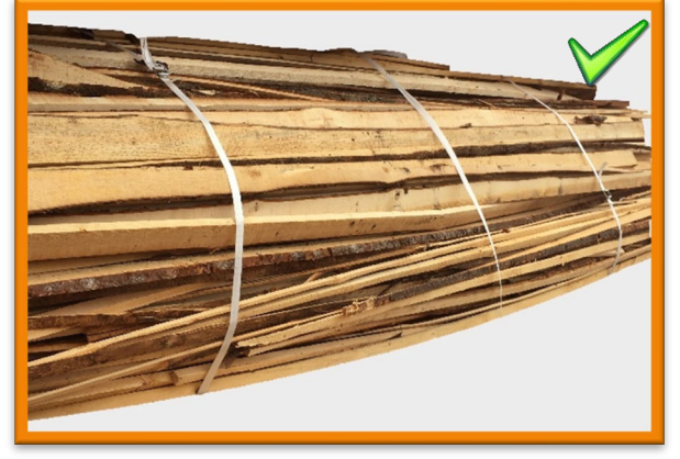
Suitable Wood Waste

Wood wastes comes from logs sawing and sawing, with a length of 2 to 4 m.