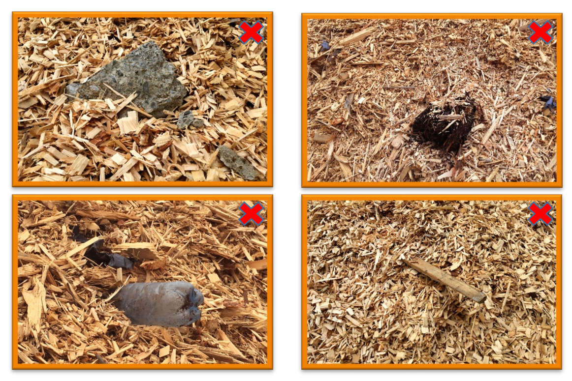
Unsuitable Chips, inappropriate objects

Delivered chips has to be clean, without any contamination and occurrence of inappropriate objects as: conifers branches, soil, stones, plastic wastes, metallic objects, pieces of wood, etc.