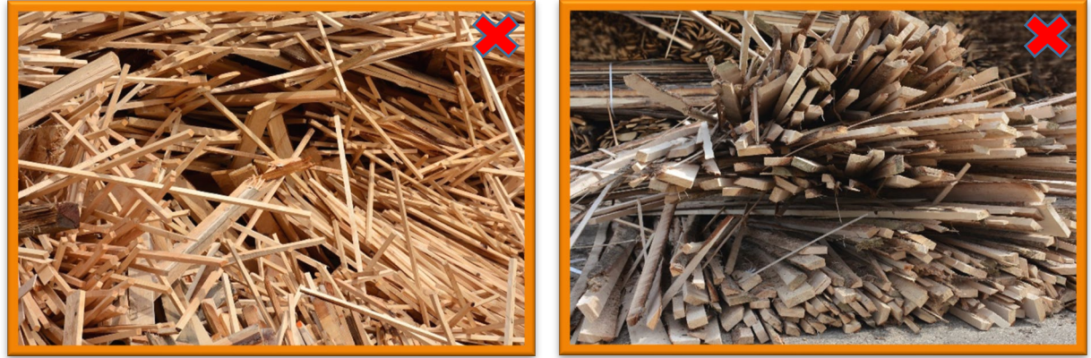
Unbundled Wood Wastes

Deliveries containing inappropriate objects such as branches, soil, stones, plastic wastes, metallic objects, pieces of wood, etc. are not allowed. The delivered material must be bundled (minimum 3 bindings per bundle). The steel bindings are not accepted. Unbundled wood wastes will be overtake and paid with 10% price reduction.