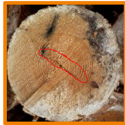
Superficial frontal core crack