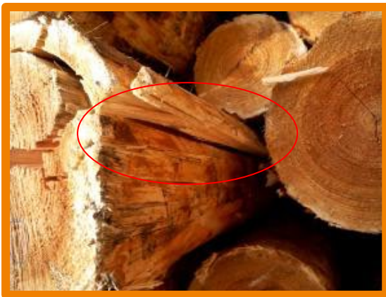
Crack on the lateral surface

Relevant are frontal and core cracks and also cracks on the lateral surface. Logs with just superficial frontal and core cracks are not downgraded, whereas logs with deep frontal and core cracks and also cracks on the lateral surface are downgraded.