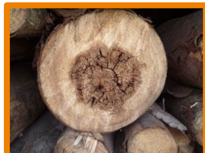
Not nail proof