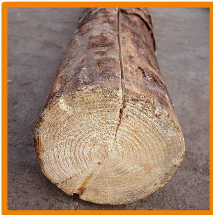
Crack on the lateral surface

Relevant are frontal and core cracks and cracks on the lateral surface. Logs with just superficial frontal and core cracks are not downgraded, whereas logs with deep frontal and core cracks and also cracks on the lateral surface are downgraded.