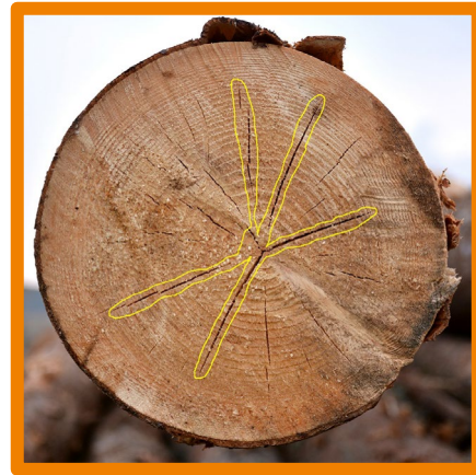
Superficial frontal core crack