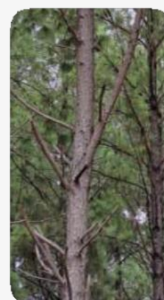
Branches with acute angles