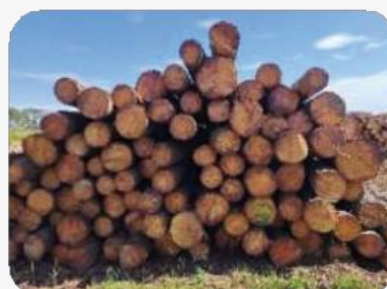
Logs with different diameters will be accepted

The categorization of diameters and the evaluation of the quality of each log will be performed utilizing results obtained from the on-site classification system specifically designed for logs with bark. This system is equipped with a 3D scanner, X-ray capabilities, and a metal detector.