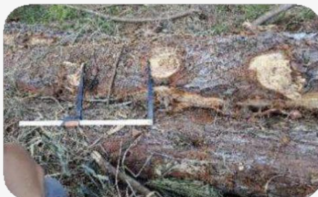
Logs with many and big knots will not be accepted. See more pictures in the Annex.

Whorls: Logs with this defect will not be accepted and will be considered as biomass.